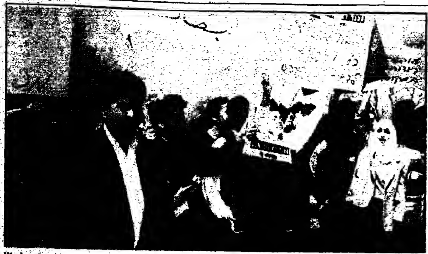
Workers protest factory closure. Histadrut chairman Amir Peretz stands opposite the Knesset yesterday with Delta textile workers from Shfaram. The women's placards read "Industrialize the Arab villages" and "Every government should provide jobs for its citizens."